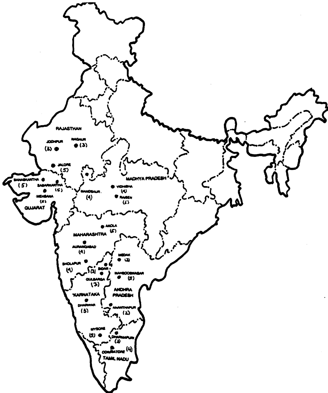
Map 1 DISTRICTS AND NUMBER OF VILLAGES COVERED BY THE STUDY ON COMMON PROPERTY RESOURCES IN DRY REGIONS OF INDIA