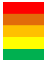
Figure 4. Level of toxicity to different types of pesticides