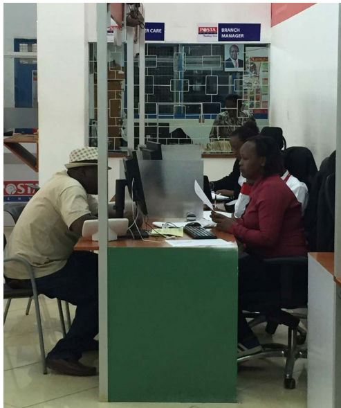
Waiting area (top) and service counters (bottom) in Huduma Center, Meru County

payments for various service transactions to the respective MDAs (Berthaud 2012). If the post office is too small or otherwise unfit to house a center, particularly in rural or isolated locations, the Huduma Center is still required to be in a government-owned building, and a post office counter with Kentswitch facilities is set up on location. Co-locating a Huduma Center in a post office also serves the post office by attracting additional business, and because the post office is state-owned, this contributes to government revenues.