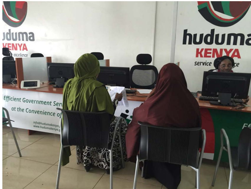
Customers being served at the Huduma Center in Isiolo.

the centers with ongoing support, responding to issues via electronic tickets and providing assistance through remote access or in-person visits, depending on the need. A generator and emergency power backup system ensures power source redundancy, and the Huduma Center's servers are kept in a separate, cooled, and secure room.