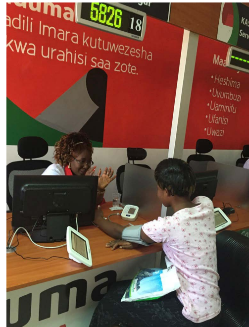
Provision of health services at the Huduma Center in Thika, Kiambu.

Staff receive training when they join the Huduma Centers, but ongoing training and refresher sessions are less common. A recurrent critique revolved around the need for ongoing training for Huduma Center staff and managers, as well as the chance to gather at an annual general assembly. Interviewees expressed a desire for additional training, opportunities to learn from others' best practices, and clear avenues for internal feedback and grievance redress mechanisms (Huduma Center staff to Secretariat). The frequency of trainings could be increased, and periodic retraining is in fact part of the performance contract, but this does not often actually happen. Interviews with Huduma Center managers suggest that the lack of ongoing training traces back to staffing challenges because the centers must be staffed. 32 Anecdotal evidence suggests that public servants at the MDAs often prefer that they not be deployed to the Huduma Centers, feeling that