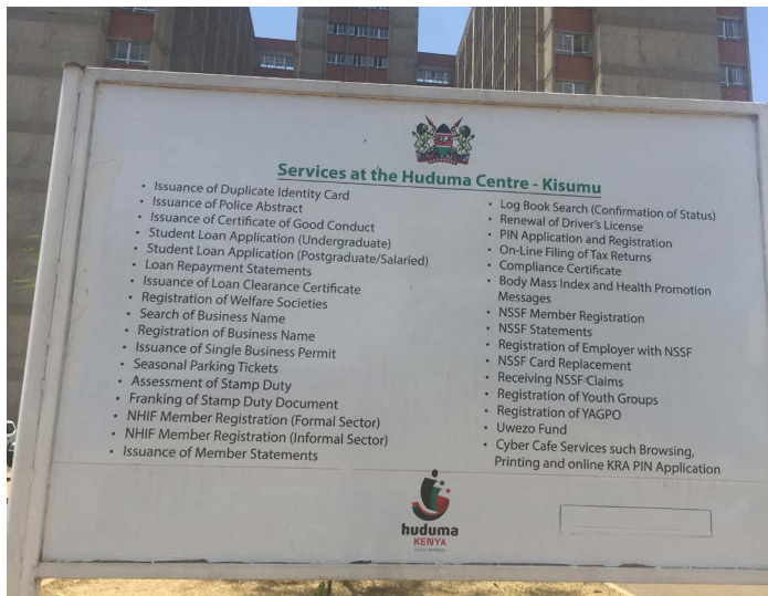
A listing of the services available at the Kisumu Huduma Center

the Huduma Kenya Secretariat, which then petitions for approval from the respective line ministry in order to deploy additional staff and service-specific supplies to the relevant center. The county commissioner coordinates changes to county-level services, but the Secretariat must approve all changes before services can be offered at a center.