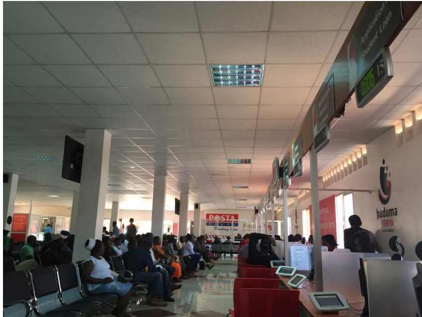
Main hall with waiting area and service counters at the Huduma Center in Thika, Kiambu