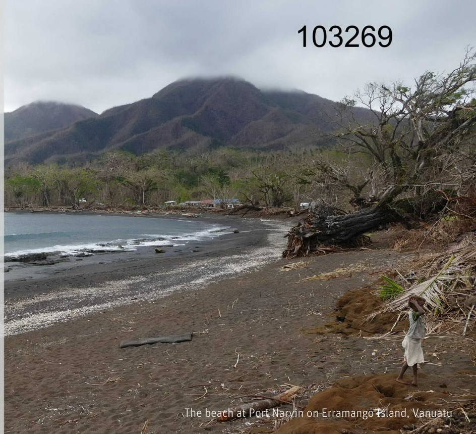
The beach at Port Narvin on Erramango Island, Vanuatu