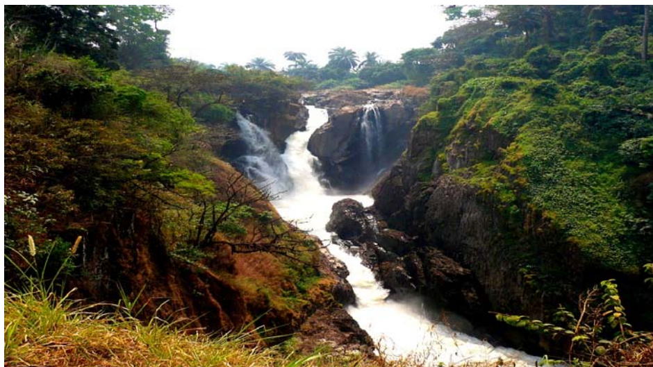
Metchum Falls, Mount Oku, Cameroon

Over the last fifteen years the World Bank has assisted the Government of Cameroon in reforming the country's forest sector through a series of policy lending instruments and a debt relief initiative. In the late 1990s, the World Bank and the Government broadened dialogue to include the donor community and national and international civil society organizations. The engagement led to increased support for the reform process, and to focused discussion on issues such as sequencing and which measures to assign priority.