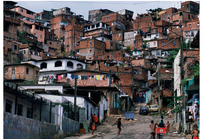
Disaster risk identification and institutional and community-level capacity building helps countries to more effectively manage preparedness and post-disaster efforts at both the national and local levels.

Creating cutting-edge disaster risk management tools, growing applied knowledge and deepening financial protections not only strengthens Brazil's ability to mitigate smaller-scale, recurrent disasters at the local level, but also helps to build urban resilience throughout the country.