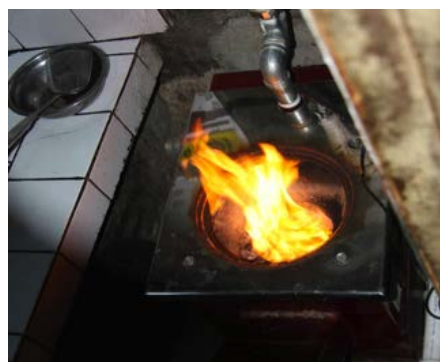
Clean cooking and water-heating stove using biomass briquettes in Gaoshanbao village

“The fact that stove programs had not previously existed in Indonesia created a unique opportunity to design a new system for testing and rating stoves, building on lessons from international experience.”