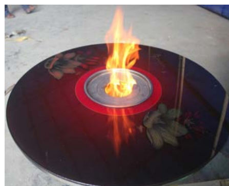
Clean cooking and heating stove using firewood in Baiguoshu village