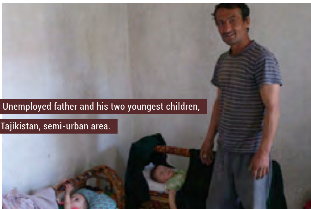
Unemployed father and his two youngest children,