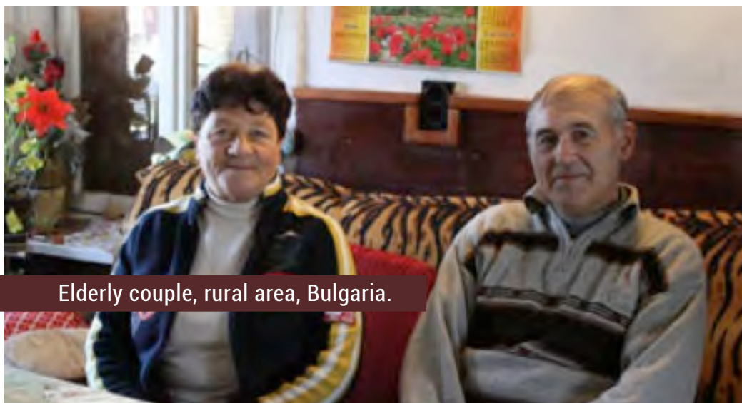
Elderly couple, rural area, Bulgaria.

While it is more socially acceptable for women to interact with social assistance offices, bureaucratic or logistical issues sometimes impede their access to benefits. A representative of an NGO that works on gender-related issues in Bulgaria shares that after introducing direct deposit payments of social benefits, it appeared that about one-third of female beneficiaries did not have a bank account. For rural women, distance from social assistance centers and other public institutions is an additional impediment to applying for benefits if they do not travel to a regional center as often as men. Lack of education or poor language skills may also impede women’s access to benefits, particularly minority women (Roma, Kurdish) who need additional assistance to prepare their applications.