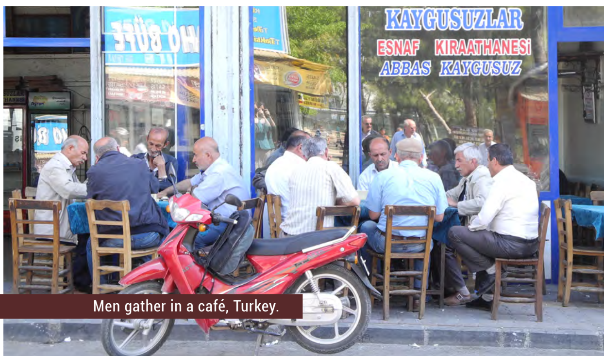
Men gather in a café, Turkey.

On some occasions, cultural stereotypes contribute to women bearing a higher burden for managing energy costs. Respondents in the Kyrgyz Republic state that it is more common for women to borrow money from friends or relatives to cope with energy payments in difficult times, as asking for money is culturally unacceptable for men. It also sometimes associated with negative stereotypes—for example, a man who asks for money might have a drinking problem. Such stereotypes are also observed in other countries in the region, and impact the way men relate to social assistance institutions.