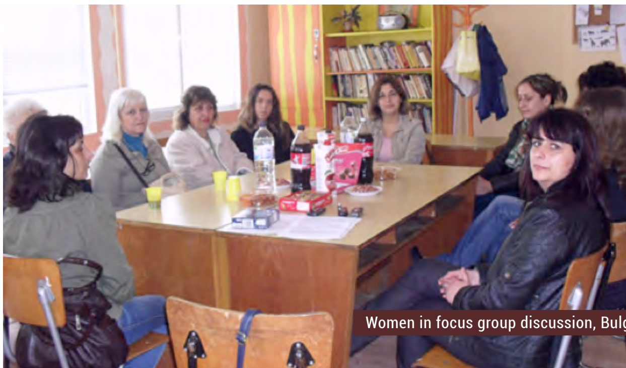
Women in focus group discussion, Bulgaria.

grams) would help men and women better adapt to these reforms.