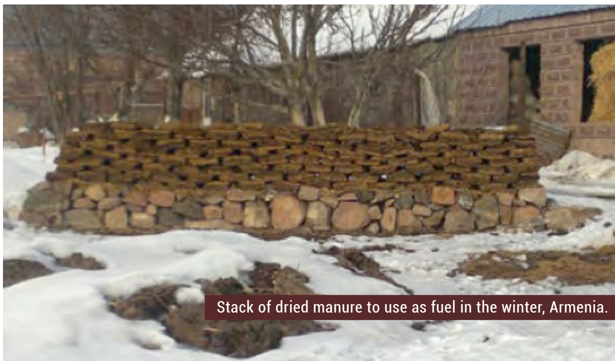
Stack of dried manure to use as fuel in the winter, Armenia.

It is largely a man's responsibility to procure wood, coal, and bottled gas; female-headed households face more obstacles and extra costs to obtain these energy sources. In all countries in the sample, men are in charge of purchasing, transporting, and storing wood or coal. This is partly a result of the physical labor involved in such tasks, but it also reflects reliance on mostly male social networks—communicating with forest rangers and wood traders, the majority of whom are men. Female-headed households face some informational and social constraints in finding and negotiating the purchase of heating fuels, and they generally outsource its transport, storage, and preparation (such as chopping wood) at an extra cost. Some female-headed households, especially those headed by elderly women, say they prefer to use electricity for heating, and to heat a smaller space in the house, to avoid the cost and labor associated with heating on wood (even though wood