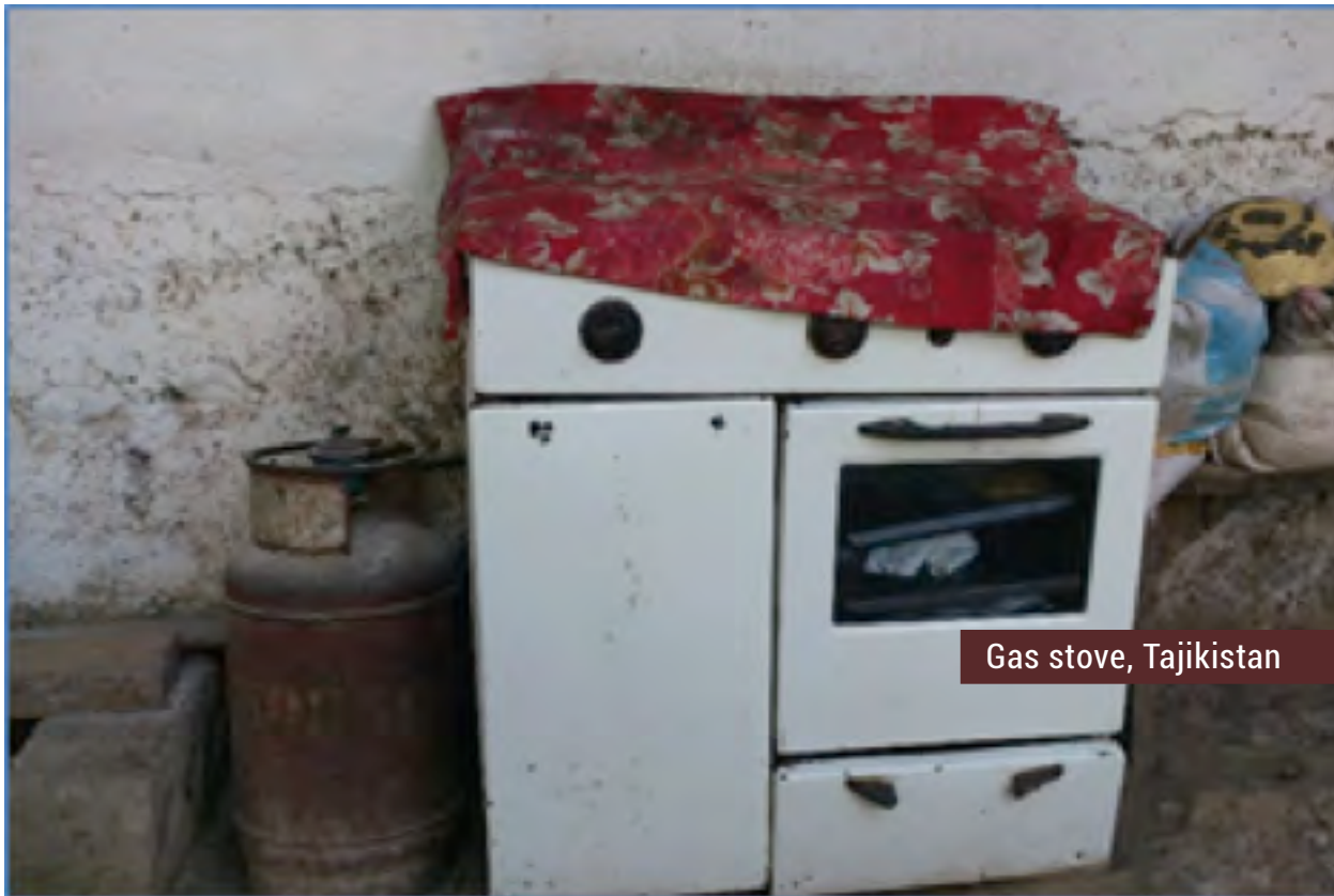
Gas stove, Tajikistan

before cutting spending on food, education, and medical needs. Men admit that they spend less on social activities, or on items such as beer and cigarettes, only as a last resort. For men, cutting spending on such activities is seen as a sign of serious financial struggle. In Belarus, women report that cutting meat consumption—a common coping strategy—is a measure more suitable for women than for men and children. Women are also generally seen as more responsible than men, and likely to prioritize bill payments at their own expense.