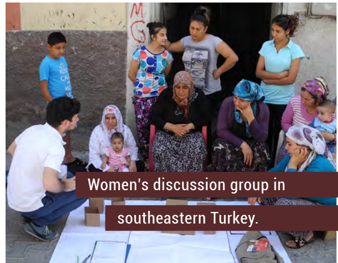
Women's discussion group in southeastern Turkey.

Gender differences are also observed in the way men and women understand and relate to energy reforms more broadly. Men tend to be better informed about energy reforms on the whole, and feel more confident exercising their rights as consumers. Men's estimates of prior tariff increases are on average more accurate than women's, and men are able to list more possible reasons for tariff reforms. Women are not as informed about reasons for tariff reforms and are rarely proactive in seeking information (as some explained, they "do not want to seek bad news"). When asked whether any service improvements may justify an increase in energy tariffs, men tend to mention a wider range of improvements than women. Women are more concerned with price