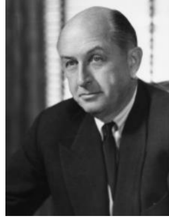
World Bank President Eugene R. Black

September 19, 2016 marks the 56 th anniversary of the signing of the Indus Basin treaty by India and Pakistan. The agreement signified the end of a long dispute between the two countries and opened the door for increased economic development in the region. The World Bank and its president at the time, Eugene Black, played an important role as mediator in the nearly decade long negotiation. This was not, however, the only time the nascent institution took on this role. A small number of prominent Bank-led mediation efforts in the 1950s illustrate how the Bank extended itself beyond the provision of loans in order to facilitate increased development.