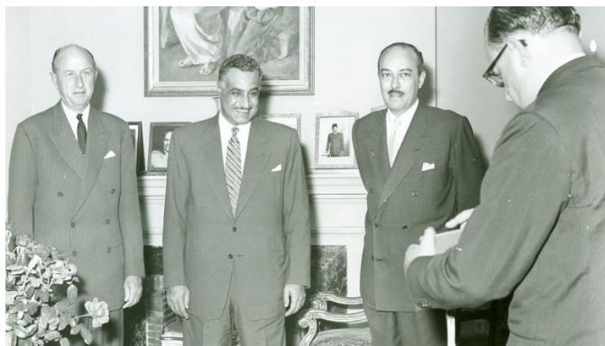
Meeting in Cairo, Egypt featuring (left to right) World Bank President Black, Egypt Prime Minister Nassar, and Egypt Finance Minister Kaissouni (file #30290119).

President Black and the World Bank became involved in another negotiation that exploited the Bank's financial and technical expertise when it led talks between Egypt, the United States, and Great Britain on the financing of a High Dam on the Nile River in Egypt. Between 1954 and 1956, Black led efforts to negotiate funding for the construction of a massive dam that would make more water available for agriculture and