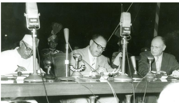
The signing of the Indus Water Treaty, September 19, 1960: (left to right) Prime Minister Nehru of India; President Ayub Khan of Pakistan; and World Bank Vice President Sir William Iliff (file #30263783).