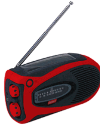
Crank Solar radio