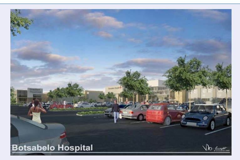
An architect's drawing of the design for the new hospital.

monitor is a consortium of companies with specialized experience in PPPs, clinical services, hospital operation and management, medical and nonmedical equipment, information management and technology, and soft and hard facilities management.