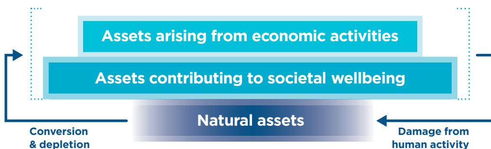
Figure 1. Unsustainable (undesired) development of oceans and coasts

Historically, marine and coastal policymaking has not adequately taken the value of these assets into account. Conventional policy frameworks for marine and coastal development have tended to prioritize the conversion of marine and coastal ecosystems into other forms of wealth such as hotels for tourists or aquaculture farms in place of mangrove forests. As a result, these ecosystems have been damaged. Figure 1 illustrates how this approach is unsustainable because it results in the net loss of the foundational natural asset base of marine and coastal economies and societies.