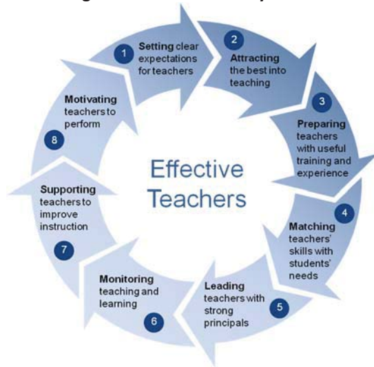
Figure 1: 8 Teacher Policy Goals

The eight Teacher Policy Goals are functions that all high-performing education systems fulfill to a certain extent in order to ensure that every classroom has a motivated, supported, and competent teacher. These goals were identified through a review of evidence of research studies on teacher policies and the analysis of policies of top-performing and rapidly-improving education systems. Three criteria were used to identify them. Teacher policy goals had to be: (i) linked to student performance through empirical evidence; (ii) a priority for resource allocation; and (iii) actionable, that is, actions governments can take to improve education policy. The eight teacher policy goals exclude other objectives that countries might want to pursue to increase the effectiveness of their teachers, but on which there is to date insufficient empirical evidence to make specific policy recommendations.