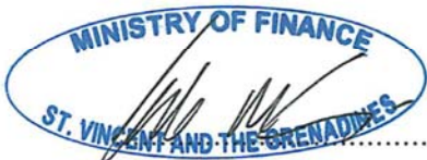
..... Honorable Camillo Gonsalves Minister of Finance Ministry of Finance, Economic Planning, Sustainable Development and Information Technology