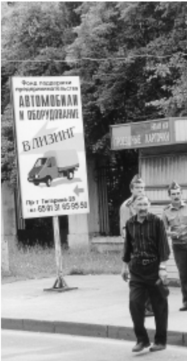
Advertisements for leasing services are increasingly common in Nizhny Novgorod

ing in a variety of ways, including direct financial support.