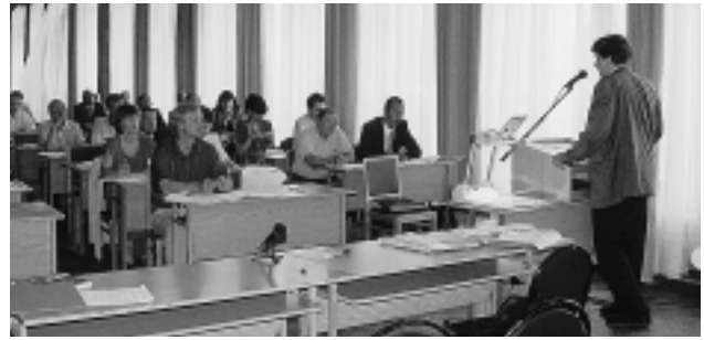
More than 60 businesses attended the Leasing for Lessees seminar

has recently opened an office and plans to offer leasing services to local entrepreneurs. In spite of the small number of active leasing companies, more and more of the region's enterprises are beginning to appreciate the advantages of leasing over other forms of finance. By the beginning of this year, the Nizhny Novgorod Small Business Development Fund had financed more than 700 leases, while the Nizhny Novgorod Leasing Company had financed more than 100 projects worth a total of 50 million rubles. The Volgo-Vyatsky Interregional Leasing Center, which opened relatively recently, serves clients not only in the Nizhny Novgorod region, but