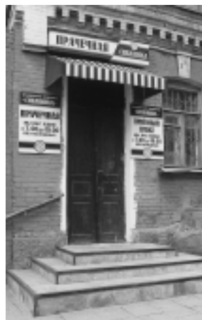
Leased automobiles allowed this commercial laundry to widen its drop-off network and create 27 new jobs