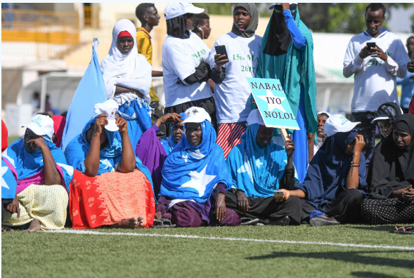
Residents of Mogadishu city attend celebrations to mark the Somalia National Youth Day at Banadir stadium in Mogadishu, Somalia on May 15, 2017. The day marks the founding of the Somali Youth League (SYL), which was Somalia's first political party founded in 1943 and spearheaded the struggle for independence.

Conflict and insecurity have resulted in limited opportunities for Somalis and youth in particular. Youth unemployment stands at 75 percent. 50 This is perceived as contributing to young Somalis' vulnerability to illegal migration, organized crime, and/or violent extremism. 51 The UN–Somali federal government's report on their joint program on youth employment found that "youth employment is without question one of the critical challenges facing Somalia on its path to stability and economic recovery." 52 It also presented available data—for example, from the International Labour Organization (ILO)—that indicate that Somalia has one of the highest rates of joblessness in the world, in particular among youth. The ILO's labor force survey estimates the youth unemployment rate at 22 percent for selected districts in southern Somalia. 53 However, for most African countries, including Somalia, measures of unemployed youth are less relevant than measures of employed youth. Among the poor, few can afford to be unemployed, as there is typically no social protection for unemployed persons. Focusing on the unemployment rate thus fails to take into account this reality. As a result, vulnerable employment and working poverty are widespread; the ILO estimates underemployment to be at 25 percent, without taking into consideration the widespread phenomena of "discouraged