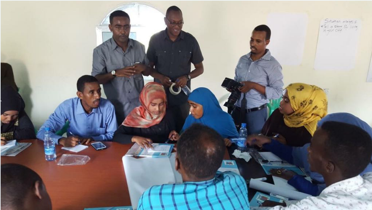
Training of Somali youth in life and job skills

Peace education can have positive impacts in Somalia. Many respondents specifically mentioned the need for education that can lead to cohesion and peace. Peace education should be offered at two levels, both within the school system and at the community level. The latter may involve NGOs, religious institutions, and other entities. These programs should employ evidence-based, active learning techniques and be culturally and contextually appropriate, focusing on specific knowledge, attitudes, and practices related to peacebuilding. Above all, they should contribute to youth empowerment and the emergence of youth-led community and local development initiatives.