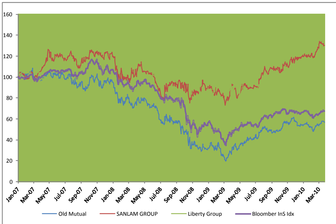
Figure 2. South Africa: Share Price Movements of Major Insurance Groups