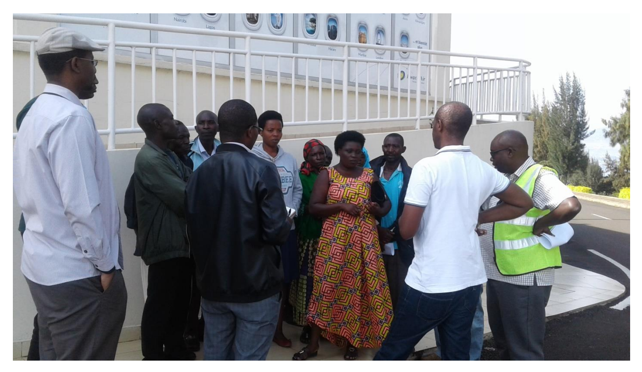
Figure 4: PAH during a meeting with a World Bank Safeguard team on 14th November 2018