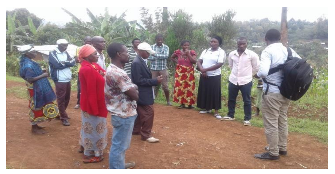
Figure 11: onsite meeting after the valuation exercise on 10<sup>th</sup> January 2019