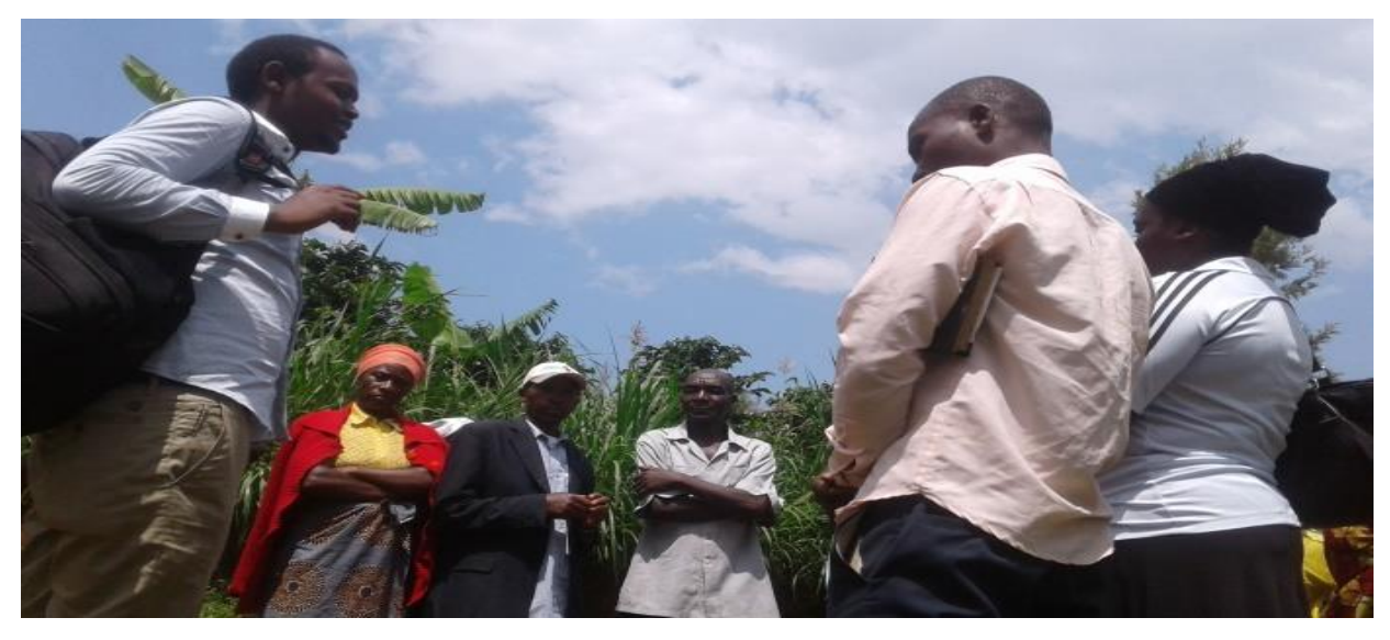
Figure 10: community assessing the case of residual land viability