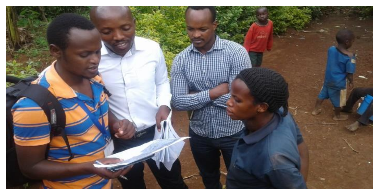
Figure 8: were explained how the evaluation was going to be done before starting to take the measurements