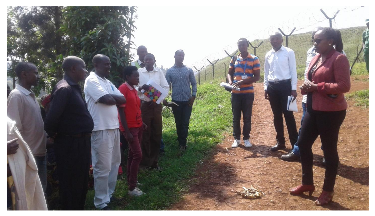
Figure 5: The Executive Secretary of Gihundwe Sector in a meeting with PAHs on 8th/01/2019