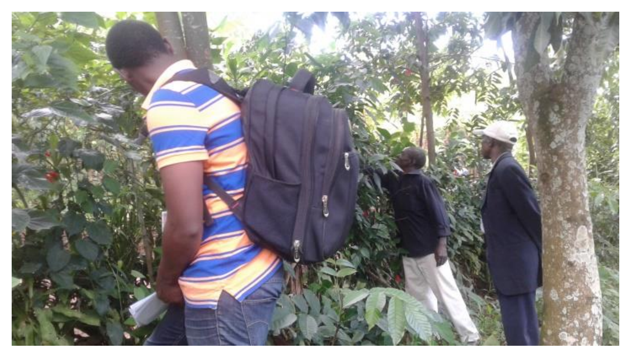
Figure 6: The asset valuation was done with the participation of the local people and respective PAHs in particular