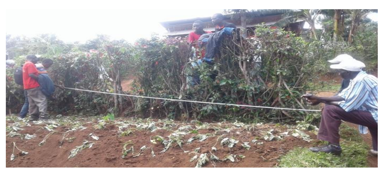
Figure 9: Plots were measured by tape

After asset valuation another meeting was organized the following day to present the final results to the PAPs and give them a room to ask clarifications on remaining concerns. It was during this final meeting that the case of residual land viability was assessed.