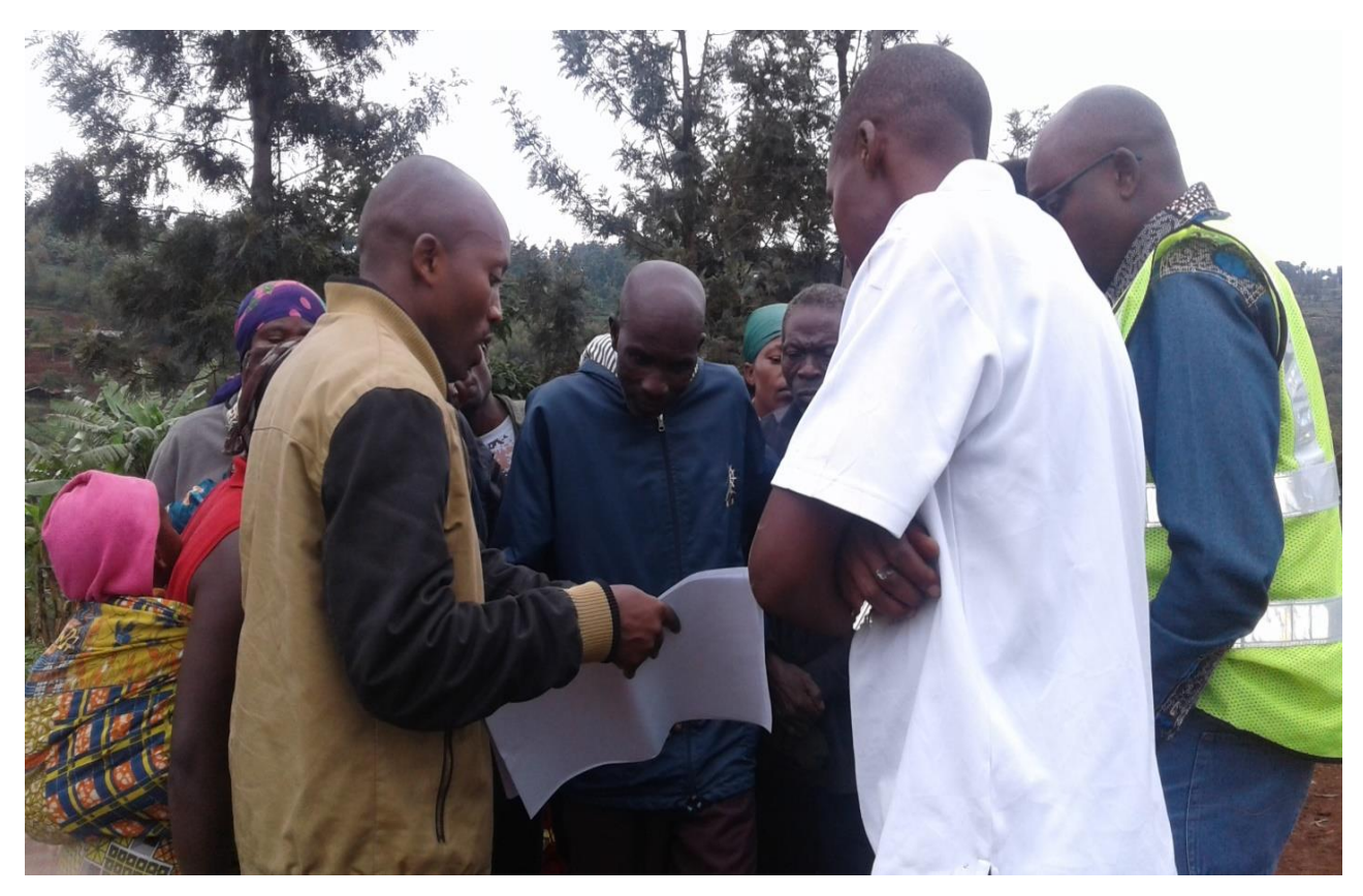
Figure 3: consultation during property demarcation on 11<sup>th</sup> September 2018

were properly identified, other consultations were carried out with property owners by RAC/RCAA under the arbitration of local authorities with the objective to agree on compensation modalities.