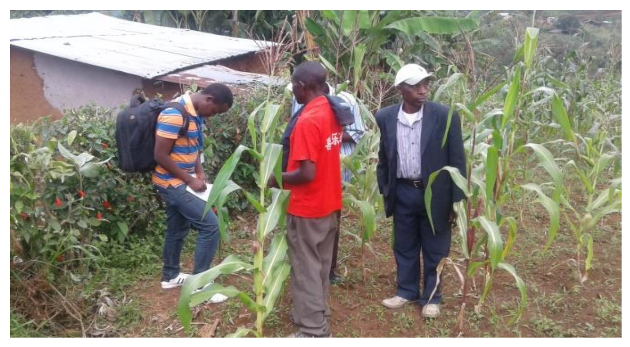
Figure 7: PAHs participating in asset valuation