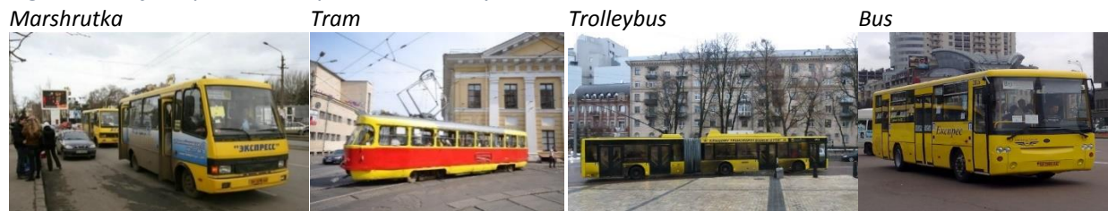
Figure 3: Surface public transport modes in Kyiv

16. The localized and GHG emissions of transport in Kyiv need to improve. The International Council on Clean Transportation estimated in 2015 that Kyiv was the fourth worst urban area for transport-attributable air pollution deaths per 100,000 people out of 100 cities considered. The estimated annual mean concentration of fine (PM 2.5) and coarse particulates (PM 10) in Kyiv's air were estimated to be 22 µg/m 3 and 35 µg/m 3 respectively according to the World Health Organization's Global Ambient Air Quality database. These figures represent 1.75 times and 2.2 times the recommended WHO limit for annual particulate concentrations. The National Ecology Center of Ukraine estimates that 87% of local pollution emissions come from traffic, of which 92% is due to private cars. GHG emissions from transport have been growing 2-3 times faster than Ukraine's nominal GDP since 2015, which implies the need for interventions that target longer term structural change in the sector. Importantly, about 71% of transport sector GHG emissions in Ukraine come from road-based modes. The proposed project integrates these considerations by i) addressing the gap between quality of transport and users increasing needs, and ii) supporting modal shift from polluting buses and cars to tramway and by improving KCSA's capacity in planning for greener transport.