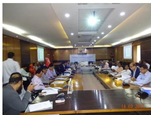
Figure A1: Consultation workshop organized by MOHFW on 14 March, 2017

After general introduction, the draft FTTP was presented through PowerPoint. A lively discussion followed the presentation and many participants made important observations and recommendations on the draft FTTP and for its effective implementation in the subsequent phase. The key points raised in the consultation on the draft FTTP is provided below in summary: