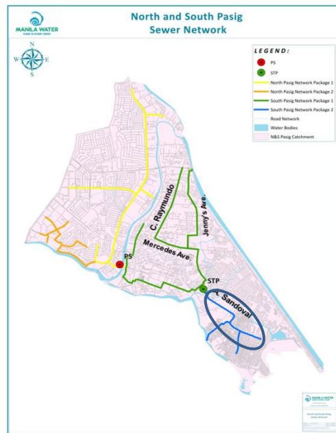
Figure 1 South Pasig 2A (within blue circle)