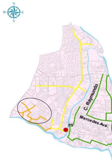
Figure 1 North Pasig 2 Gravity Sewer Network Alignment (encircled)

The North Pasig Package 2 Gravity Sewer Network contract is a component of the sewerage system. This covers the cities of Mandaluyong and Pasig. The sewage flow being captured by this network will be conveyed through a pump station and force main (North Pasig 2 Pump Station and Force Main, a link project to the nominated projects under MWMP) and will be captured by the North Pasig 1 Sewer Network. See Figure 1. This includes pipelaying for diameter ranging from 200 mm to 600 mm. This contract covers the cities of Mandaluyong and Pasig. The roads where the pipes will be laid are main