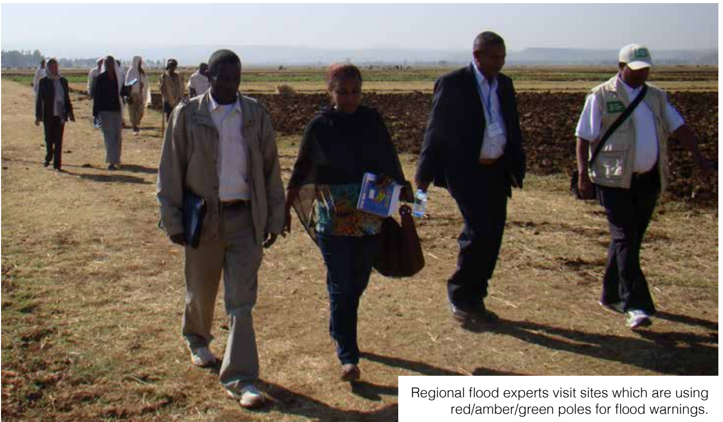
Regional flood experts visit sites which are using red/amber/green poles for flood warnings.

Through FPEW, early flood warnings currently reach around 150,000 vulnerable community members in Ethiopia and 200,000 people in Sudan, and the forecasting indirectly benefits nearly 2 million people. Replication of FPEW in the Awash valley means another 4 million people will be able to access early warning messages. Through these bulletins, the citizens of the Nile can better understand and prepare for floods. While the FPEW system continues to evolve, devastation from flooding is on the decline.