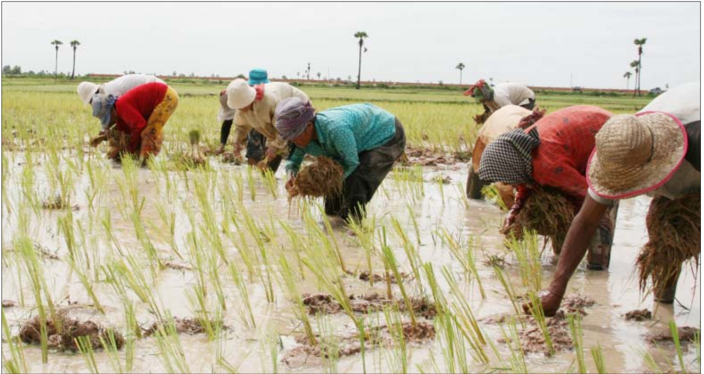
Giving farmers title to their land gives them the security to invest in the development of their farms.