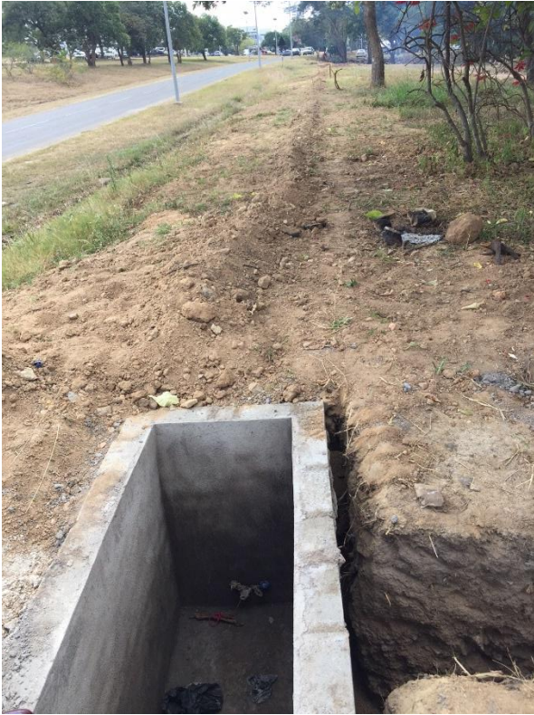
Underground fiber connection to VLP