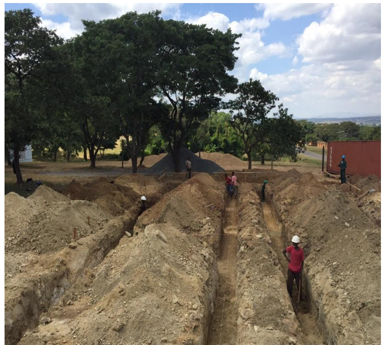
VLP under Construction