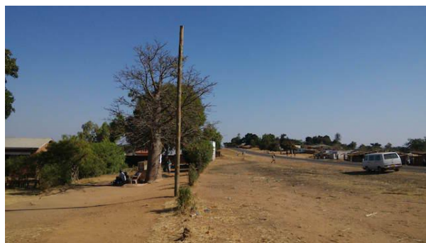
Photo 5: Pole with a tree that will likely require trimming and compensation