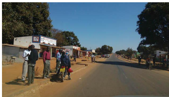
Photo 6: Network crossing a trading center with stores within road reserve