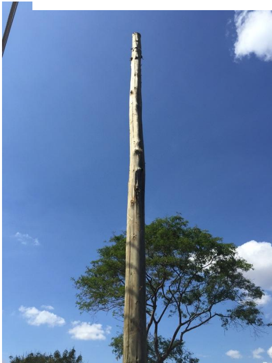
Newly Installed Pole