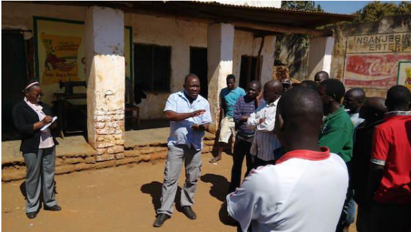
Photo 4: SIMABNET Safeguards Specialist informing some local along the network the nature and purpose of the project