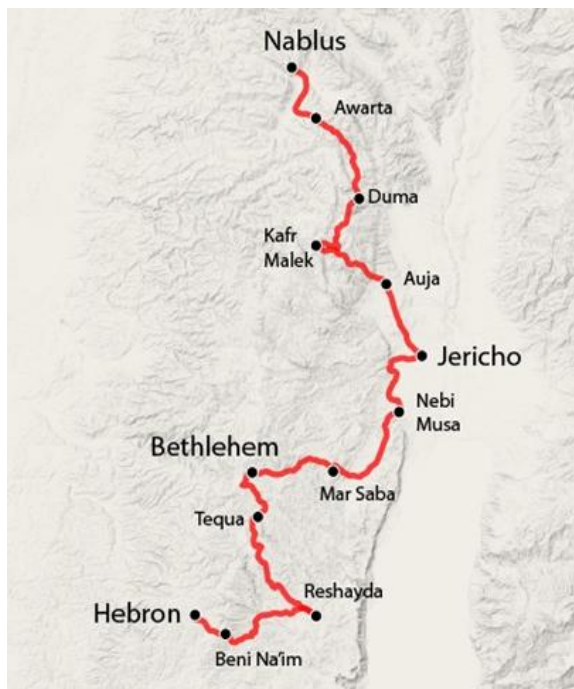
Abraham's Path in the West Bank, Palestine

Nearly 114 miles (182 km) of trail has been identified in Palestine, with hospitality, local guiding, and homestay houses in communities along its way. The Palestinian segment of the Path passes 13 communities and villages in areas A, B and C in the Palestinian West Bank; starting from Nablus in the North of the West Bank, and ending in Hebron in the south. In Israel, a 30-mile (48 km) segment of the Path from Arad to Be'er Sheva has been scouted and includes sites linked to Abraham such as Tel Sheva, Tel Arad, various Bedouin villages, the Falahin village of Derjat and Abraham's Well in