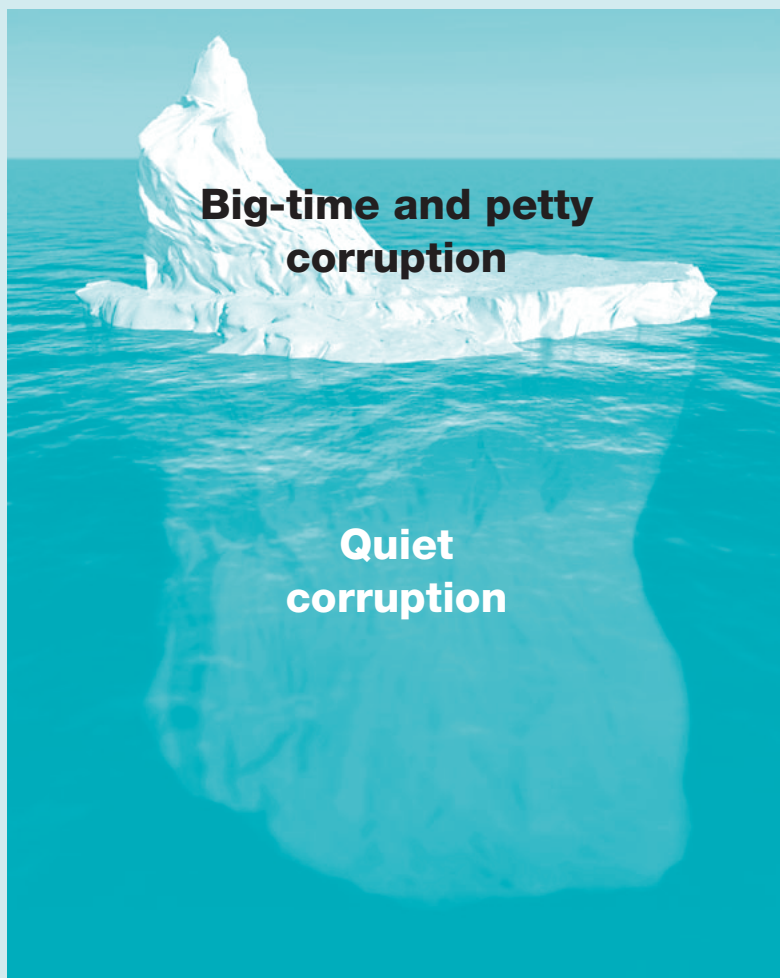
Figure 1 Big-time and petty corruption are the “tip of the iceberg”

The concept of quiet corruption is captured in Figure 1. The familiar forms of corruption—both big time and petty—are just the “tip of the iceberg”; the less frequently observed deviation from expected conduct is quiet corruption. In addition to capturing the notion that quiet corruption is not very visible, the iceberg analogy provides two additional insights. First, quiet corruption occurs across a much wider set of transactions affecting a large number of beneficiaries directly. Quiet corruption is arguably present in a large share of doctor–patient or teacher–pupil interactions, for example. Second, quiet corruption plausibly has deep long-term consequences on households, farms, and firms. Comparing the long-term consequences of different forms of corruption is a hazardous undertaking. In addition