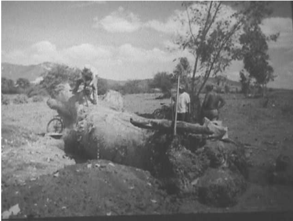
Figure 2. Flood Damage in Posoltega

2.7 The trees and wood used to produce (carbonize) charcoal came from the south side of the Casitas volcano. This area was covered by a dry natural forest containing different types of trees of widely varying sizes—up to 1.5 meters in diameter and 30 meters tall. The flood carried trees and other pieces of wood down to agricultural zones, where they mixed with the soil and rocks (see Figure 2).