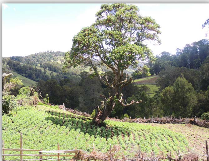
Figure 3 Typical small agricultural plot in the Cherangany Hills

102. The Panel met with a number of people living within the gazetted forest boundaries who would clearly be affected by any attempts to enforce a realigned boundary. The most notable examples are people living in the glades within the Embobut forest and those people living “below the road” in Embobut. The Panel team also met in Kapsero with community