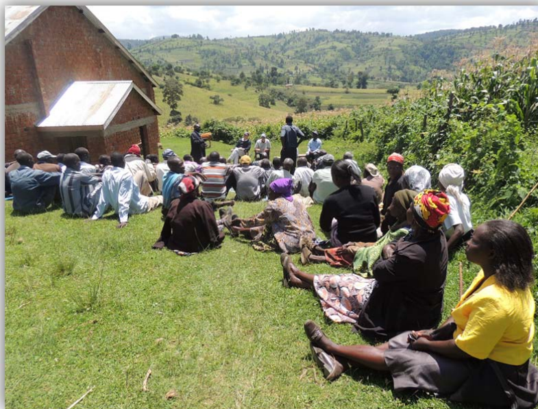
Figure 5 Panel team meeting with Cherangany/Sengwer community

210. Finally, and regarding the objection raised by the Requesters that livelihood projects had benefited some non-Cherangany-Sengwer, and that other communities should not benefit in the same way from the livelihood components, the Panel notes that the selection of the beneficiaries was undertaken by the VMGPs, and not by the Project itself. Furthermore, OP 4.10 (in a footnote to paragraph 12) states that when non-indigenous peoples live in the same area with Indigenous peoples, the IPP should attempt to avoid creating inequities for other poor and marginal social groups. The Panel acknowledges that from a development perspective, it would neither be feasible, nor desirable for the benefits of the VMGP to be given exclusively to one particular group, especially when communities are mixed or live in close proximity to each other, as in this case. Therefore, the Panel finds that by ensuring that benefits from livelihood activities in mixed communities reach IPs as well as non-indigenous peoples, the Bank is in compliance with OP 4.10.