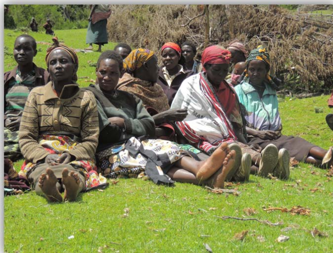
Figure 4 Project affected people The Panel met with during its visit

147. The Panel therefore notes validity in concerns raised by Requesters that the decisions at restructuring made some of the Project’s goals, including identifying sustainable partnership arrangements with communities for the protection and management of the forest, and safeguards, more difficult to achieve. The Panel recognizes that the moratorium on evictions served as an important safety measure carried through restructuring, but the more