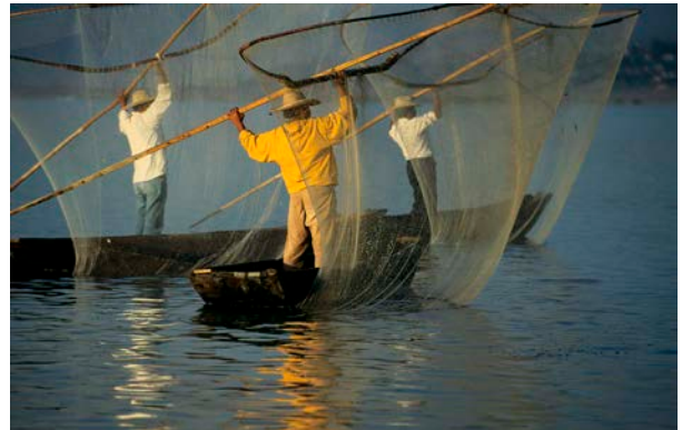
Local fisherman in Mexico.

Interest rate risk can increase debt-servicing costs, putting pressure on national budgets and forcing countries to impose spending cuts or tax reforms. The World Bank helps countries manage this risk with market-based risk management tools such as the IBRD Flexible Loan (IFL). Over the past 17 years, the World Bank has helped over 40 countries with a combined US$70 billion portfolio use the IFL.