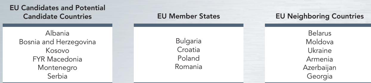
FIGURE 2 FINSAC GEOGRAPHICAL FOCUS

Group 2: EU member states as active non-graduated World Bank clients: Bulgaria, Croatia, Poland, and Romania. FinSAC is currently active in Romania and Croatia. However, since the Austrian Government wishes to restrict the utilization of the their trust funds