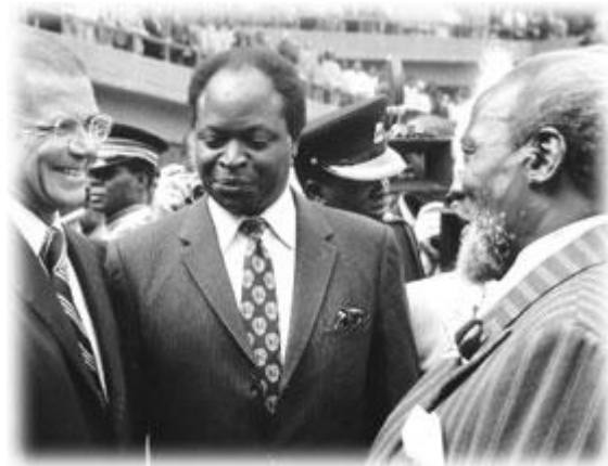
Left to right: Mr. McNamara, President of the World Bank Group; the Hon. Mwai Kibaki,

In his speech McNamara spoke of the urgent need to pay more attention to