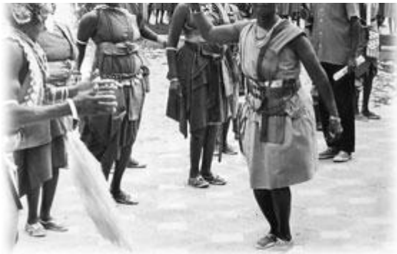
Native dancers perform outside the Kenyatta Conference Center, Sept. 24, 1973

The 1973 Annual Meetings resulted in a pledge of $22 billion by the World Bank Group for nearly 1,000 projects during the next five years to target the problems of the rural poor in the developing countries.