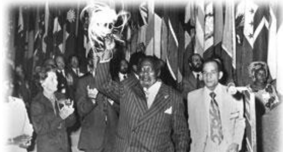
President Kenyatta (center) arrives at the Kenyatta Conference Center to open the Annual Meetings, Sept. 24, 1973