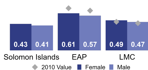
Change in Female Labor Force Participation 2012-2022 (p.p.) Ages 15+