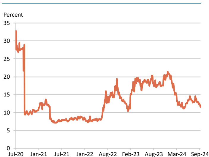
FIGURE 1 Ecuador / Emerging Market Bond Index (EMBI)

Labor market conditions slightly improved, with the unemployment rate dropping 0.7 percent y-o-y in June 2024 (3.1 percent), resulting in a 1 percent decline in poverty (national poverty line) and a virtual stagnation of the Gini at 45.6 in 2024. Job quality remains a structural problem, with informality increasing 0.7 percent y-o-y to 53.5 percent in 2024 (76.6 percent in rural areas). Structural gender gaps