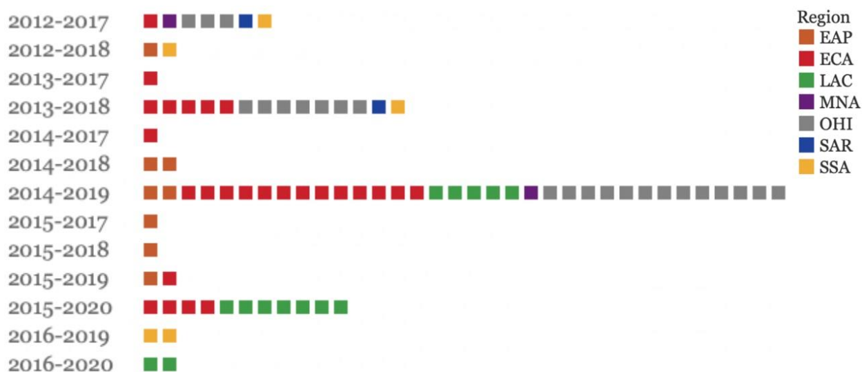
Figure 1. Periods of Measurement for Shared Prosperity, circa 2014–2019