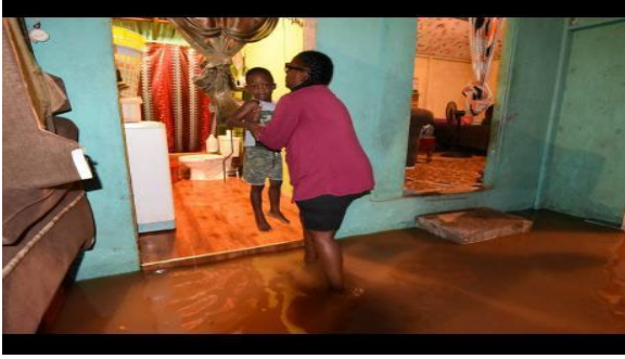
Resident in Bannister lifts her son to safety inside her home that was flooded during Tropical Storm Grace.