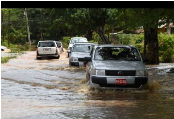
Taxi operators and private passenger vehicles navigating the flooded streets in the Big Pond community.

The Big Pond area was in the past also emptied by an earthen drain which discharged into the Myton Gully. According to anecdotal information and media reports 3 , the constant build-up (dumping) of the drainage passage to facilitate construction of residential buildings and access roads has severely obstructed this waterway. Consequently, the area has become more susceptible to flooding, especially during major storms.