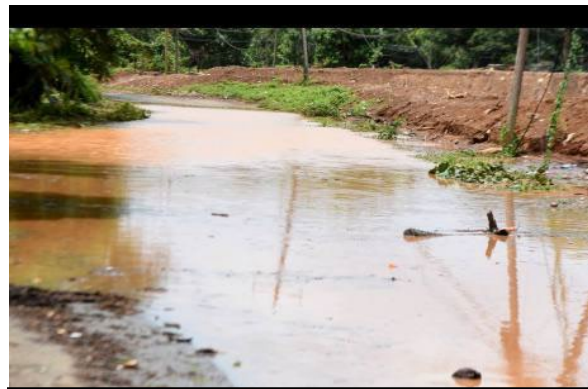
The Main Road through Big Pond Flooded by heavy rains after Tropical Storm Elsa caused the Pond to overflow.