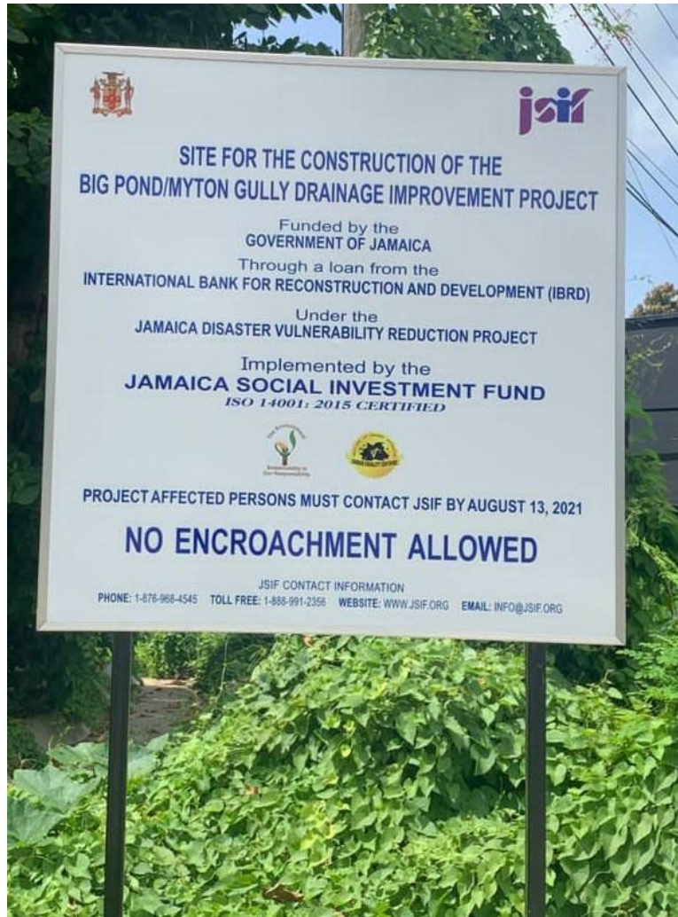
Figure 3: Project Sign with Cut-off Date

The sign above was used to ensure consistent information is being communicated to all affected persons. Additionally, the sign provided detailed contact information for persons who wish to contact JSIF directly.