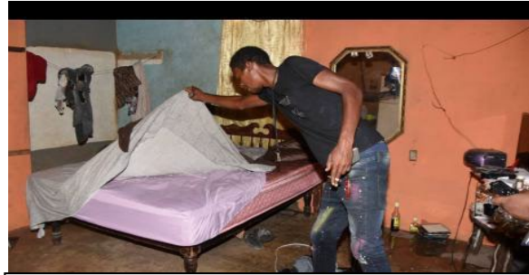
Resident shows how his home has been flooded due to the heavy rains caused by Tropical Storm Elsa.

The solution is to reinstate the major drain to Myton Gully which would necessitate the improvement of the Myton Gully course from Bannister to the bridge on the Old Harbour main road. (The length of the course from Bannister to Old Harbour Bay is approximately 10 kilometres). The Myton Gully drainage in Old Harbour, St. Catherine has been appraised for drainage improvement works under the JDVRP project. Another consideration is that Old Harbour is the fastest growing community with residential and commercial lots transformed into multiple housing developments and business complexes over the last decade. Such rapid development has also placed demands on the limited drainage infrastructure which now requires an upgrade. Overall, the Myton Gully to Frazer’s Gully channel spans across multiple housing schemes in Bannister, Claremont, Old Harbour Glades, Marlie Acres, Old Harbour Villas and New Harbour Village.