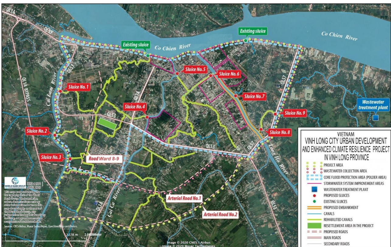
Figure 1: Project Map

and risk informed manner and to set the stage for the development of Vinh Long as a smart city through leveraging disruptive technologies. The proposed project will support implementation of Vinh Long’s smart city framework currently being developed, through investments in data and information and communication technologies (ICTs) including software, in conjunction with counterpart fund from the province. Combined, these activities should improve knowledge of the built and natural environments, which can better inform decision making in the future. For example, it will create a visual representation of flood risk overlaid with existing people and assets to guide future development in a risk-informed manner, away from high flood and climate risk. Analysing data related to lack of access to basic services, population income level, and density will also enable decision makers to identify areas of high health risk to prepare for and respond to future health crises. Key investments under Component 4 include an integrated flood risk management information system, strengthened IEC and O&M on wastewater management, a geospatial data sharing platform to improve data sharing across different departments, and an intelligent transportation system (ITS). Component 4 will also provide technical implementation support to the implementing agencies in Vinh Long.