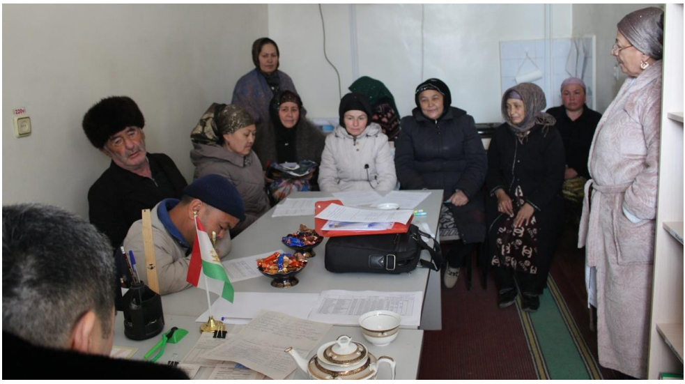
Figure 3 Consultation in Yangiobod Jamoat, Spitalmen District, Sughd Region