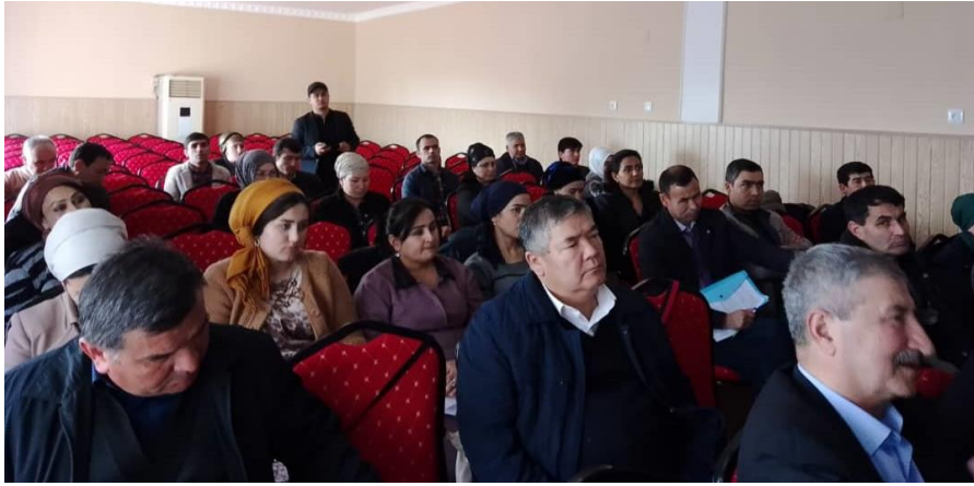
Figure 5. Consultation in Guliston Jamoat, J. Balkhi District