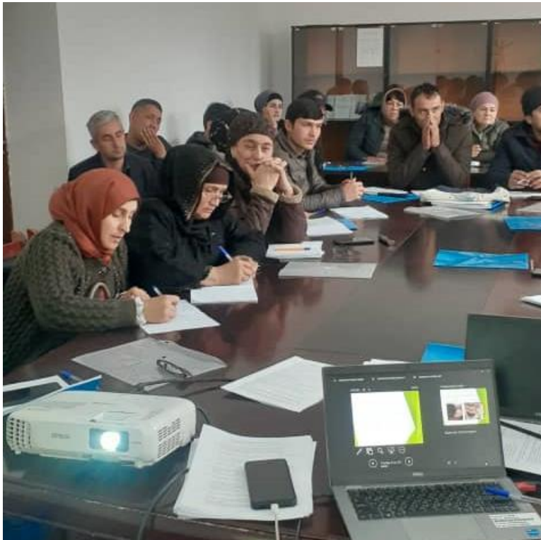
Figure 7. Consultation in Kyzyl Kala Jamoat, Khuroson District