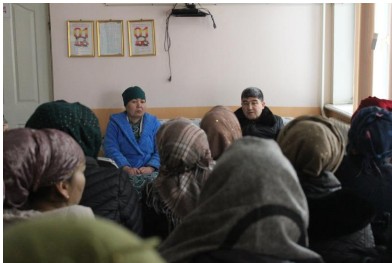
Figure 2. Consultations in Kurush Jamoat, Spitaamen District, Sughd Region