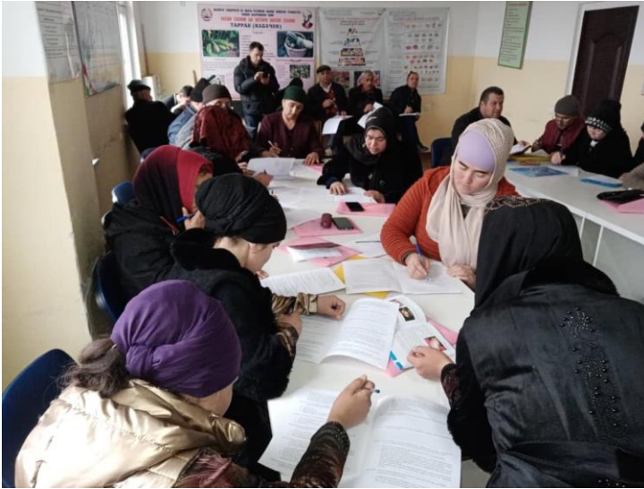
Figure 4. Consultation in Navobod Jamoat, J. Balkhi District