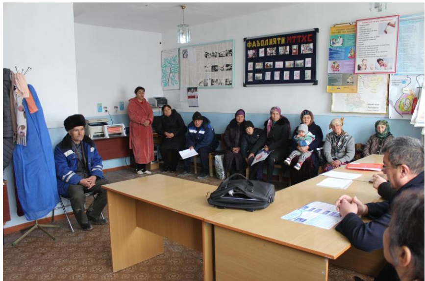
Figure 1. Consultations in Gazantarak Jamoat, Devashtich District, Sughd Region

Ҷамолиева Ҷамоли раис Ҷамолиева Ҷамоли раис