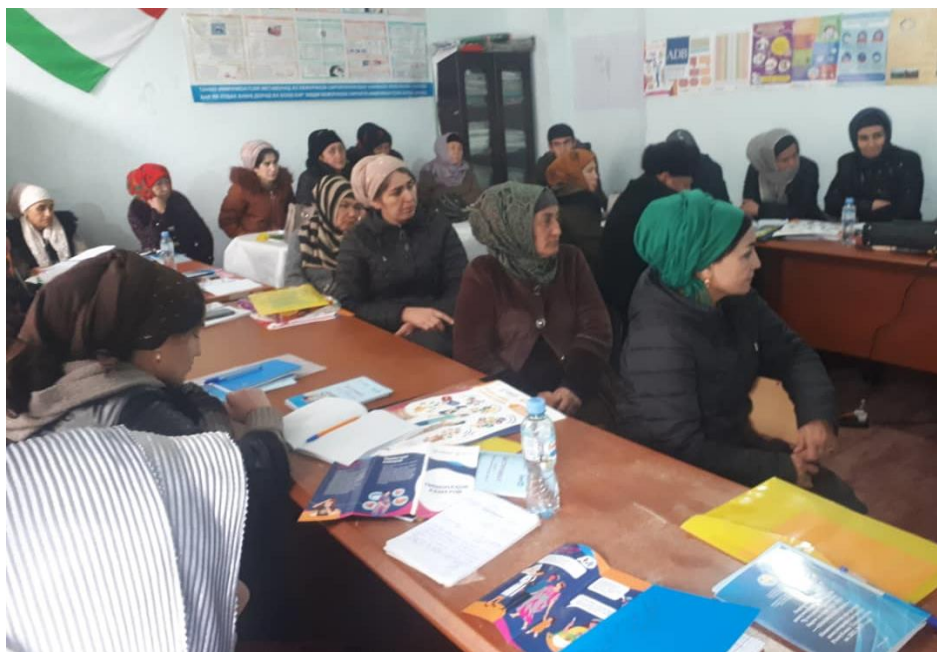
Figure 6 Consultation in Fakhrobod Jamoat, Khuroson District