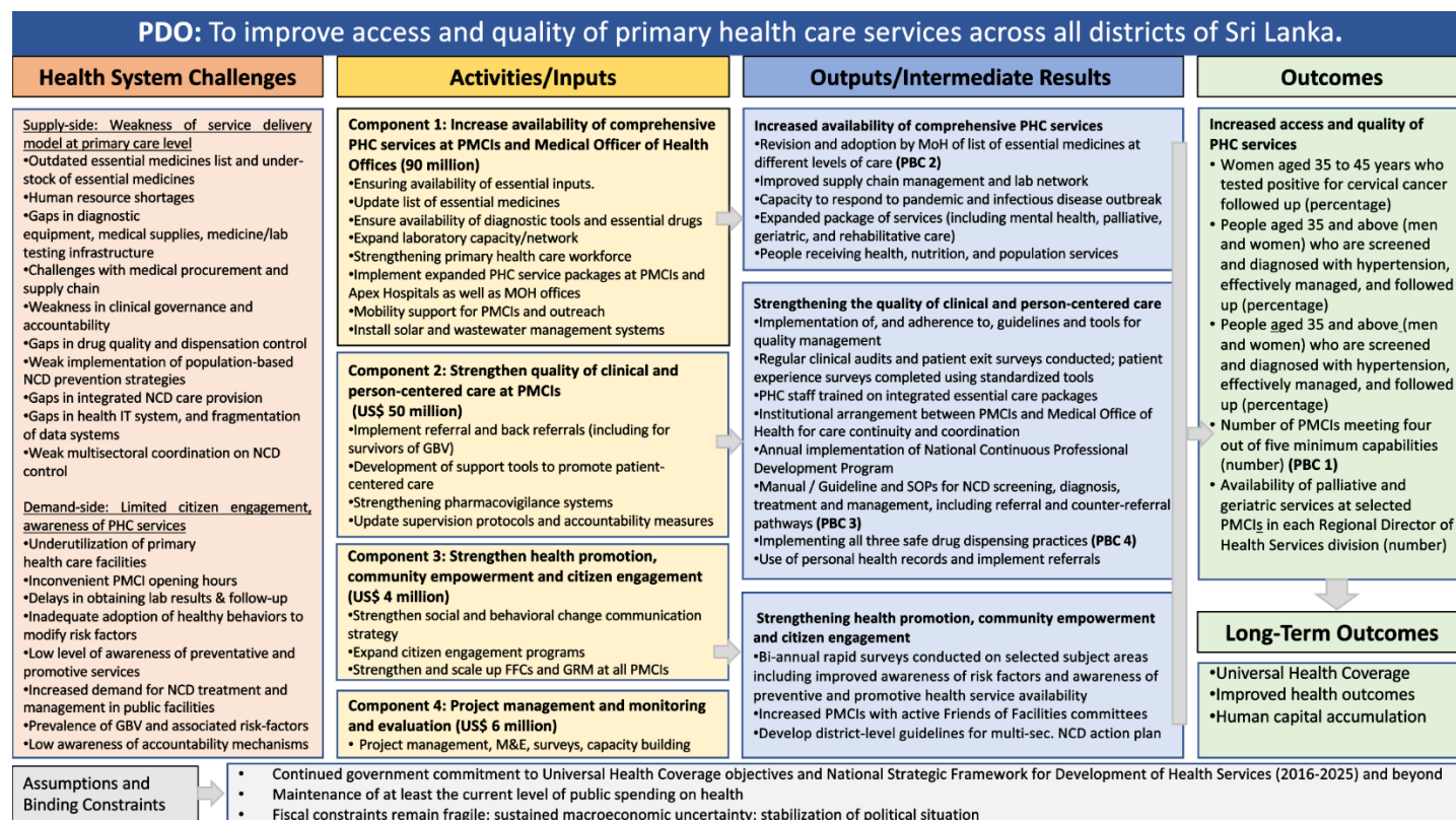
Figure 1: Results Chain