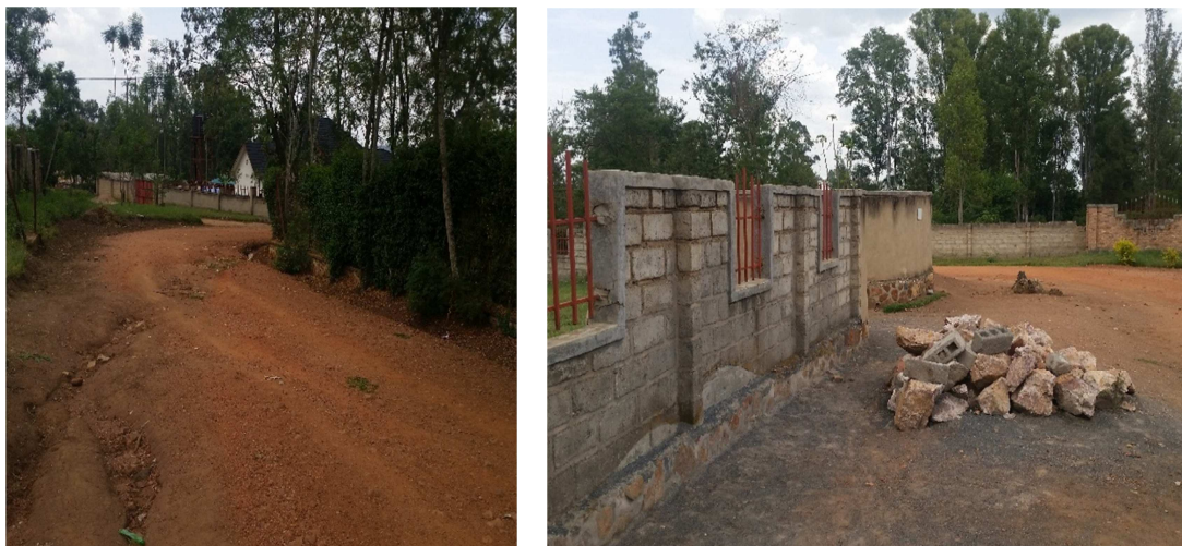
Figure 2: Some of the assets that will be affected during the implementation of the project

As in any projects funded by the World Bank, the principle of avoiding, minimizing and mitigating any likely adverse impact including involuntary resettlement was emphasized during the design stage of the project. In this perspective, an attempt has been made to avoid expropriation as much as possible as per the primary criteria of development scheme for Phase I selected investments in Nyagatare District. However, the impact on a few properties could not be avoided even after applying all necessary measures.