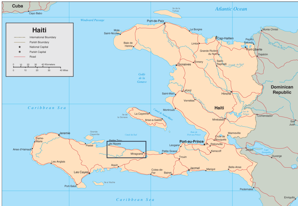
Maps 1 and 2 : Project area

32. RPLP is designed to restore ecosystem services at sub-watershed level to safeguard and enhance agricultural production, reduce vulnerability of economic and ecological systems to external shocks, and to strengthen capacities for the long-term sustainable management of those landscapes. The investment will result in the provision of environmental services, private and public goods, including enhanced watershed services encompassing soil conservation, hydrological services, and biomass supply.