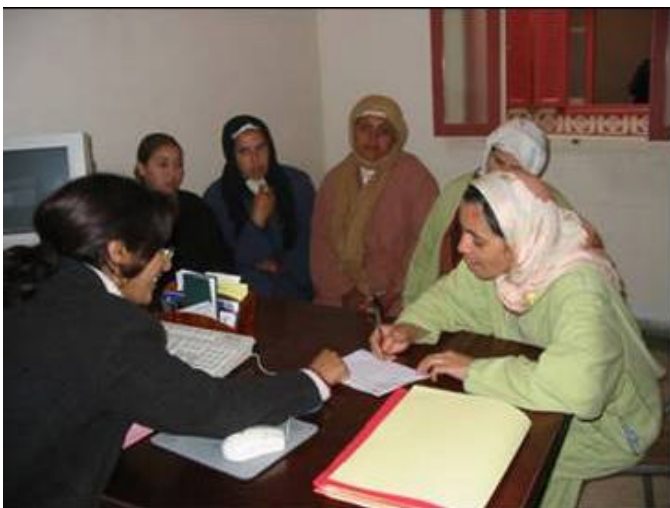
Al Amana Clients signing for a group loan disbursement in Kenitra, Morocco.

USAID's starting point was a bilateral agreement with the government of Morocco to undertake a microfinance project. This precipitated official interest in formulating a law to regulate the sector. The Ministry of Finance was charged with drafting a new law that would govern microfinance institutions. Over the next two years, USAID was an active supporter of the discourse between government policy makers and local microfinance