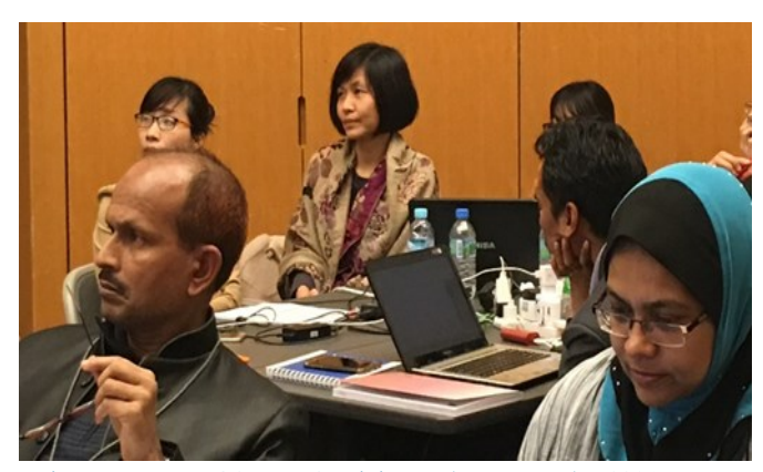
Joint WB/IMF/JICA MTDS training, Tokyo, December 2016

presented to the full set of participants, examining key assumptions, change in risk ratings and factors supporting these. Survey returns highlighted a strong appreciation for the quality and content of the course; at the same time a number of attendees suggested that the 'MAC' DSA be incorporated in DMF-supported training programs more prominently as well, as countries move progressively toward improved access to global financial markets.