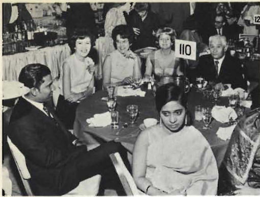
Guests at the party.