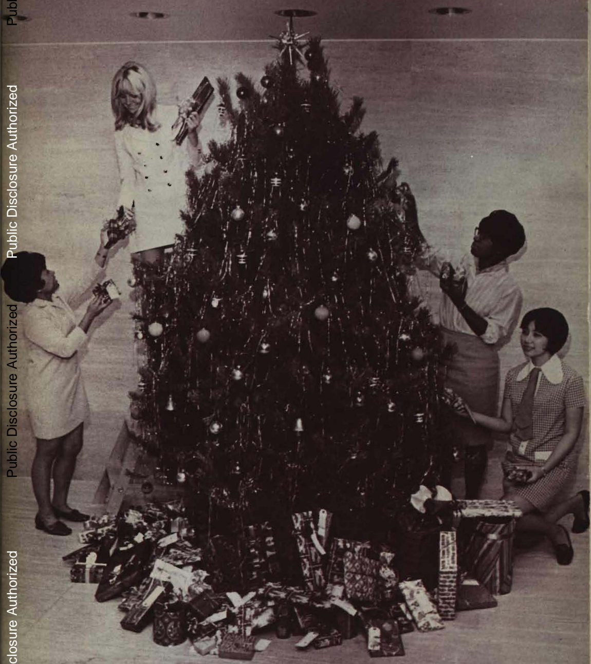
Christmas Spirit 1969