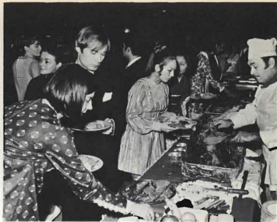
Everyone enjoyed the buffet dinner.