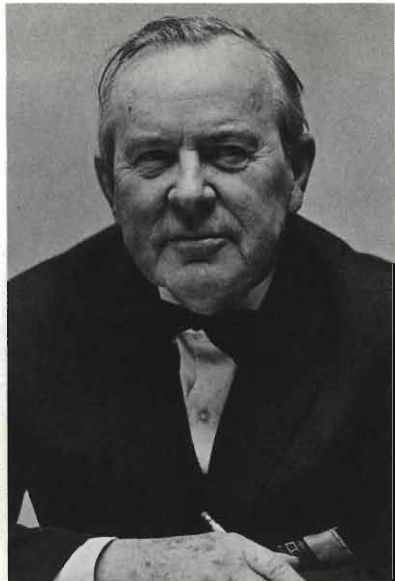
Rt. Hon. Lester B. Pearson, Chairman of the Pearson Commission.

Now that the work of the Commission has been completed the support staff of about 30 has dispersed from the offices furnished for them at 1900 L Street. A number on secondment from their permanent positions in various countries have now returned to their regular work. Some others hired especially for the Commission have transferred to permanent work in the Bank and a few others lent from the Bank to the Commission on a temporary basis have also returned to regular full-time duties with the Bank.