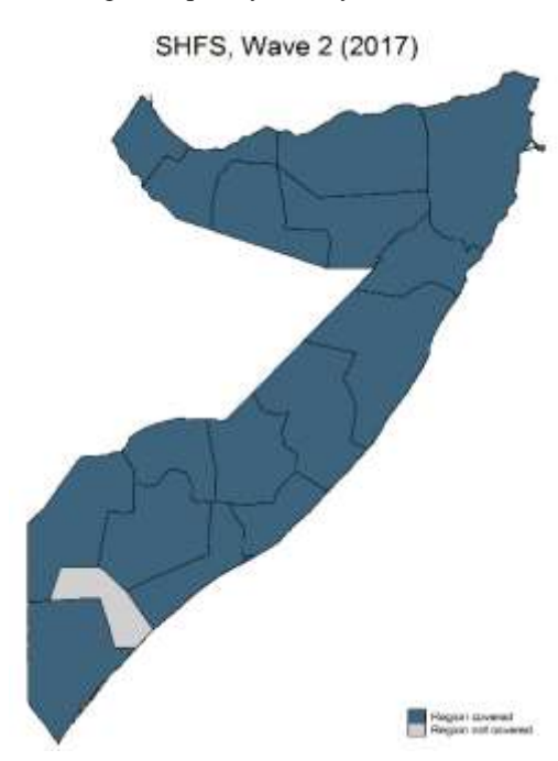
Figure 1 Geographical coverage Somali High Frequency Survey- wave 2

in urban areas in the above geographic areas, as well as households in IDP host communities. In all, the sample covered 16 out of 17 pre-war regions (see Figure 1) and was stratified into 57 strata (see Table 1 in Pape and Wollburg 2019, for full details on the population coverage). The Primary Sampling Units were randomly drawn proportionate to size, based on the constructed sampling frame using satellite images for rural areas.