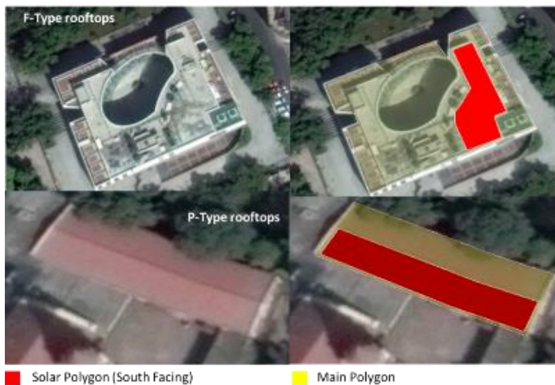
Figure 1: Main and solar polygons

The ratio of the main polygon area and solar polygon area was determined for all 909 polygons. To determine the representative multiplication factor for each building type (e.g., public, commercial), a weighted average was used. These multiplication factors were applied to building data to determine the usable roof area. Based on this methodology, the total usable area for RSPV installations in Turkey was estimated at 1.1 billion square meters (m 2 ).