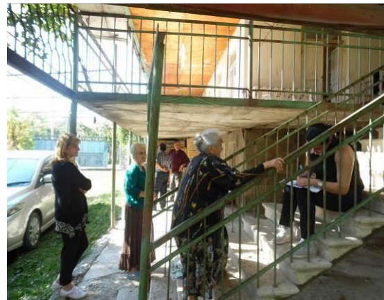
Photo 1 and 2: September 29, 2015 discussing with PAPs regarding the project