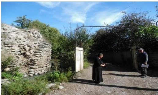
Photo taken on September 29, 2015 and reflecting the wall of the fortress

Rehabilitation of the Zeda Ru Irrigation Channel will not affect employment and agricultural tenants, since it does not require land acquisition.