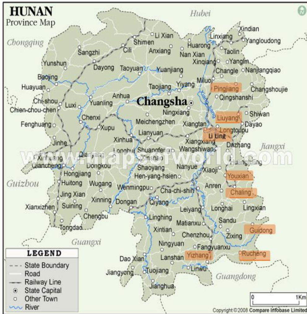
Figure 2.1: Map of Hunan province and 8 selected counties.

The proposed PforR would strengthen intergovernmental fiscal management, enhance financing mechanisms for rural roads maintenance and compulsory education in pilot counties, and scale up selected practices across Hunan Province. As such, the PforR will support activities in two results areas: (1) strengthened fiscal management and accountability; and (2) result-oriented financing for enhanced public services.