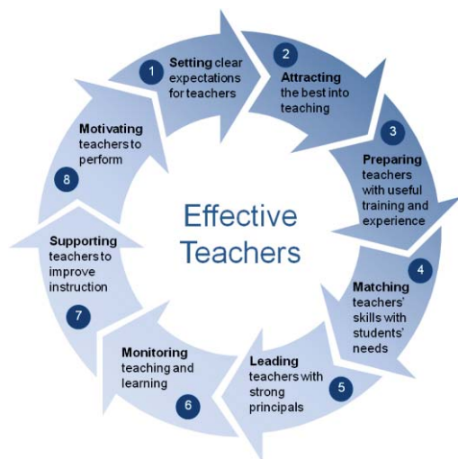
Figure 1. Eight Teacher Policy Goals

All high-performing education systems fulfill these eight teacher policy goals to a certain extent in order to ensure that every classroom has a motivated, supported, and competent teacher. These goals were identified through a review of research studies on teacher policies, as well as analysis of policies of top-performing and rapidly improving education systems. Three criteria were used to identify the teacher policy goals: they had to be (1) linked to student performance through empirical evidence; (2) a priority for resource allocation; and (3) actionable, meaning that they identify actions that governments can take to improve education policy. The eight teacher policy goals exclude other objectives that countries might want to pursue to increase the effectiveness of their teachers, but on which there is too little empirical evidence at present to allow specific policy recommendations.