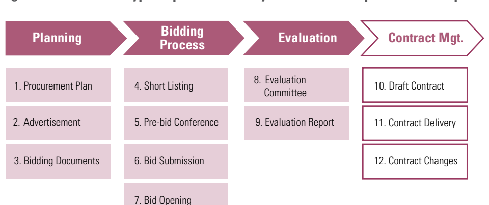
Figure 1. Phases in a typical procurement cycle where corruption can take place

While it is difficult to prove that someone has paid a bribe, there are related activities that can be uncovered more easily. Complaints from disgruntled [losing] bidders and the paper trail left by a government official steering a contract to a favored bidder are common starting points. The following section in this handbook deals with indicators, or red flags, which public officials can look for when supervising contract awards. A combination of certain red flags should alert them that a bid rigging scheme may be affecting their investment. Corrupt practices and bid rigging can take place at any stage during the procurement cycle. Sophisticated planning of corrupt activity usually starts at the project design stage when the activities are determined and contracts planned. Officials generally have a level of discretion in drafting specifications or qualification