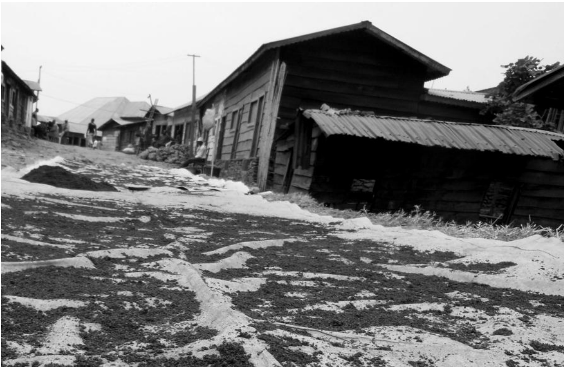
Cassiterite dries in the sun in the town of Nyabibwe, Kalehe Territory