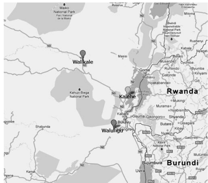
Figure 1. Map of Research Sites

This study was approved by the Internal Review Board (IRB) of the Harvard School of Public Health (HSPH) and a Congolese Community Advisory Board (CAB) of subject matter experts. All members of the research team underwent training in ethical research practices. Qualitative questionnaires were developed to mirror the human rights framework guiding the project, with a focus on key CEDAW provisions (see Table 1). Once questions were developed to explore each domain of human rights, the draft questionnaire was then reviewed by field staff of the partner NGO who worked in mining sites. The final questionnaire was translated and back translated from English into Kiswahili. All focus groups and key informant interviews were attended by at least one note-taker and one moderator. During Phase II of the project, the questionnaire was edited and refined through discussions with HHI and local project staff. See Annex 1. for a description of which populations were interviewed in each site.