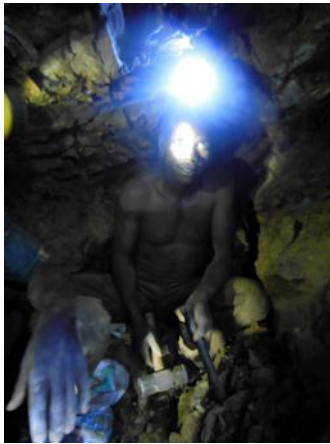
A man mines cassiterite in a quarry near Nyabibwe, Kalehe

Fear that mines would be shut down and livelihoods lost because of negative reports from this project was another problematic issue. Despite working with trusted and long-established local partners, and repeatedly explaining the academic nature of the work, these concerns persisted to varying degrees on each axis. They were most pronounced in Nyabibwe on the Kalehe axis. Nyabibwe has been the target of a great deal of attention from the national government, multinational entities working on mining issues and NGO initiatives. As a result, there is awareness of sensitivities around women and children working in mines and great concern about the international perception of mineral exploitation. In sites on the Walungu axis, these issues were much less pronounced and people talked more frankly about women's and children's roles in the mines. Despite these challenges, the results of this project did triangulate in on important themes. Across highly diverse populations and very different contexts, certain problems seemed universal.