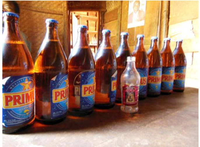
Alcoholic “energy drinks” are commonly consumed around mines. The small clear bottle pictured here has as much alcohol as the nine beers lined up behind it.

Drug and alcohol use is described as being rampant in mining towns and inside the quarries themselves. The effects of substance abuse are an increase in violence and a breakdown in the social fabric of their villages. Miners say drugs are used to dull the suffering they experience while mining. Alcohol and drug abuse allows them to go deep into the earth with less fear, and makes many more able to fight off competition when needed. The chief of the village of Mushinga noted, “Regarding alcohol, oh! la la! there is so much in these neighborhoods, it is also the problem, really! There they take the hemp, strong liqueurs, Sapilo, Life Force with 45% alcohol which is equal to the amount of 9 bottles of beer primus, Kanyanga 7 in any case these drugs ... really ... who could be successful in changing this? ... It is these same drugs that cause a man to be able to forcibly at a woman on his shoulders and rape her.” Miners in Nyabibwe relate alcohol abuse to fuel for vehicles, saying;