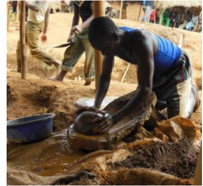
A gold miner grinds the earth he has brought out of the quarry in Walungu

In the preliminary phases of establishing the project, local partners facilitate introduction to the following actors in each field site: town administration officials; customary chief; women's group leaders; leaders of economic cooperatives; religious leaders; key actors in mining process. Not all of these actors were accessible in each site; rather this list provided a guide for thinking about the types of players that could be sought out in each context. In initial interviews, the research team requested referrals to others stakeholders involved in the process who could continue to inform the research.